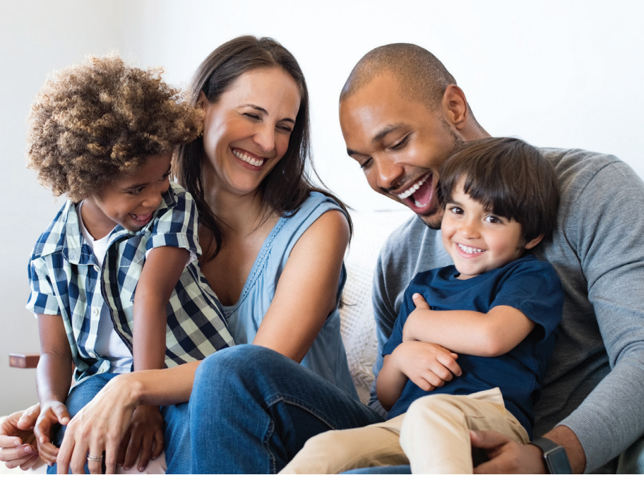
Continence Care Products