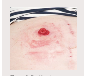
Figure 3 Significant improvement after changing to the CeraPlus skin barrier.

Many people with ostomies experience peristomal skin issues and accept them as a normal aspect of having a stoma; despite pre-and post-operative information they are given. Thankfully, this patient sought help and the problem was resolved. Achieving a good fit around the stoma and preventing leakage as a means of mitigating skin irritation may not be enough to keep the peristomal skin healthy. The formulation of a skin barrier also has an impact on the health of the peristomal skin. Finding the right combination of skin barrier formulation to support skin health, and a secure skin barrier fit is essential to maintaining a healthy peristomal skin environment.