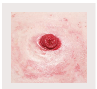
Figure 4 Close up of the visual improvement to the peristomal skin.